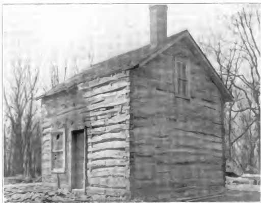
FORMER HOME OF THOMAS THOMPSON Built before the town of Lake Mills was established.